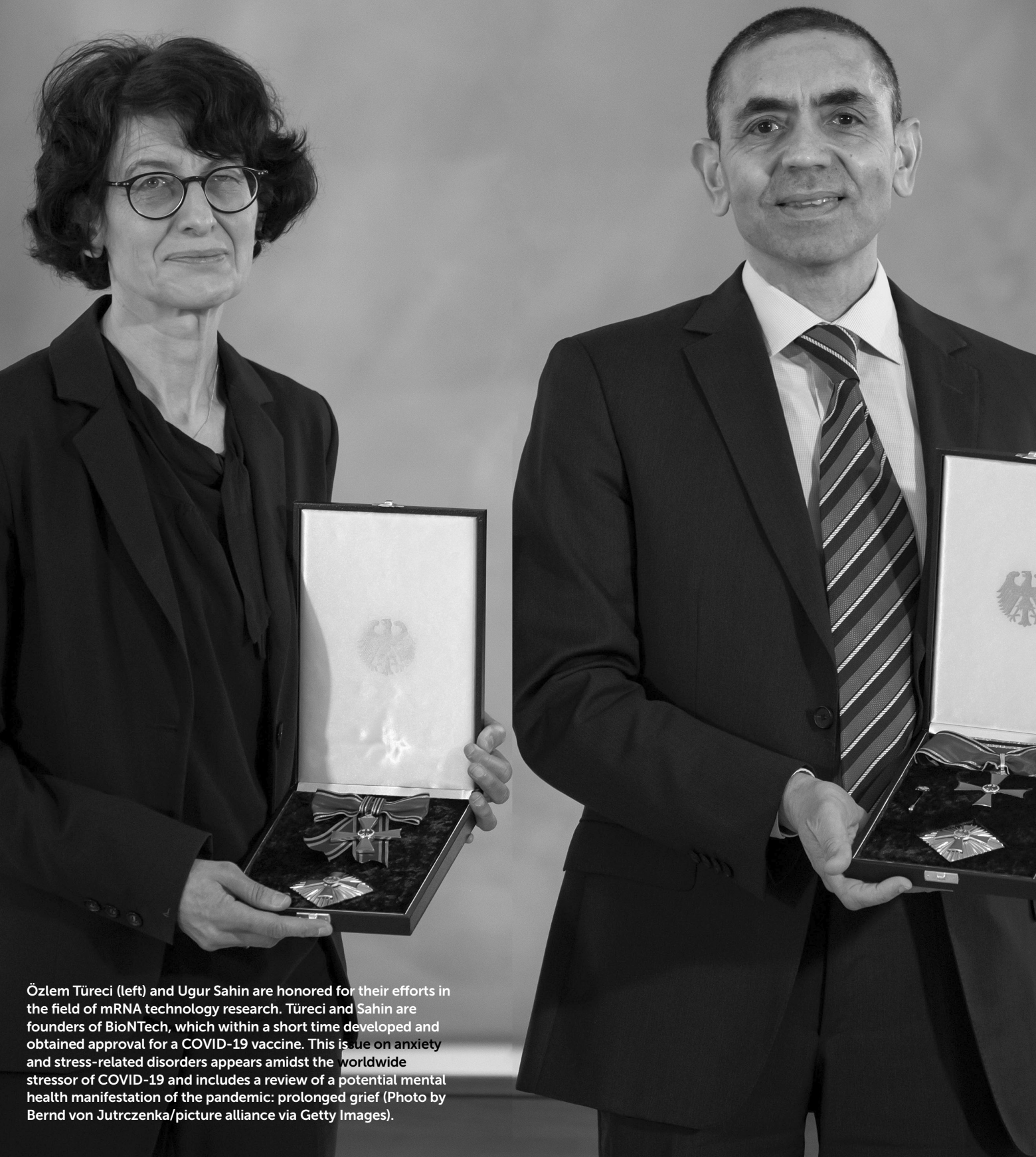
Özlem Türeci (left) and Ugur Sahin are honored for their efforts in the field of mRNA technology research. Türeci and Sahin are founders of BioNTech, which within a short time developed and obtained approval for a COVID-19 vaccine. This issue on anxiety and stress-related disorders appears amidst the worldwide stressor of COVID-19 and includes a review of a potential mental health manifestation of the pandemic: prolonged grief.